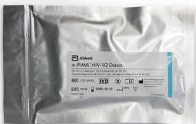
m-PIMA™ HIV-1/2 DETECT