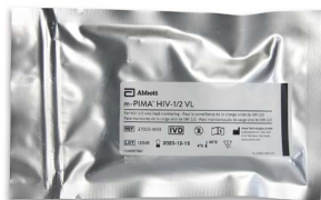
m-PIMA™ HIV-1/2 VL